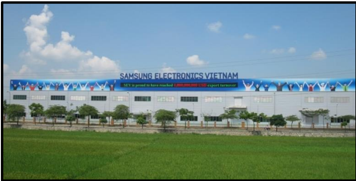
The Samsung Electronics plant in Bac Ninh displays its massive export numbers on the outside of the building.