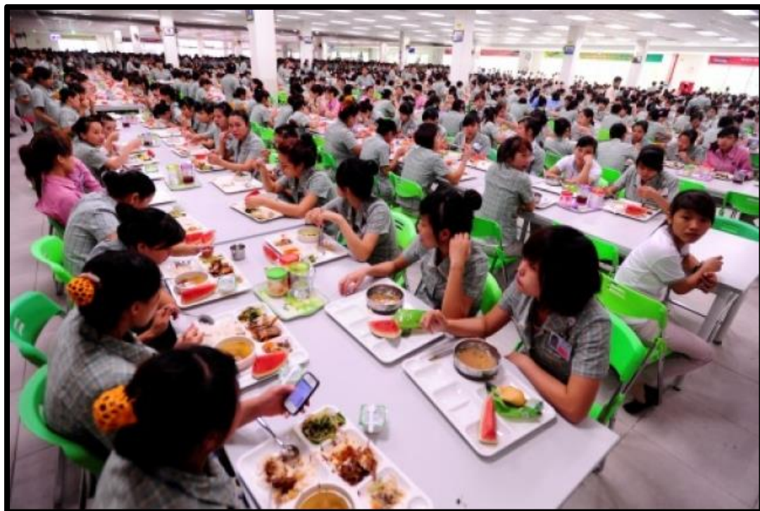
Lunch time at Samsung Vietnam.

As the company comprises many factories, workshops, and production lines, most of the workers do not know the number of employees in the company or even in their own workshop. They may know that the number of workers in their line (the smallest working unit) usually consists of 10-14 workers.