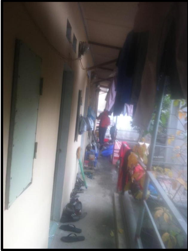
The number of sandals indicates how many women live in a single room.

“Working here is not my purpose. I feel fed up. I work here to make money for immediate living needs. In the future, I want to go back to live with my parents or get married to a husband living close to my parents. My parents do not want me to work here either. Now I want to go back to school and find a job close to my parents’ house or open my own shop.” – IDI.35