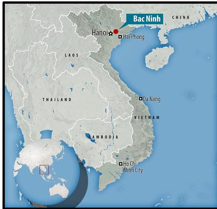
Samsung's Bac Ninh plant is located in the north near Hanoi.

as respecting the interviewees, anonymity and information confidentiality. The questionnaire has terminologies relating to sexual harassment that are sensitive in Vietnam. Therefore, regarding such questions, the interviewer explained them clearly to the interviewee and started the interview only when the woman felt sufficiently comfortable. All interviews utilized informed consent and guaranteed confidentiality to protect worker identity.