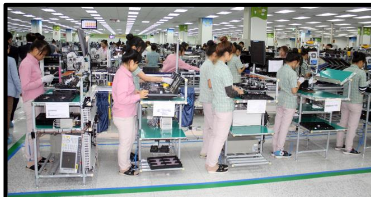
Mobile phone assembly at Samsung Electronics in Vietnam happens standing up.

“I think working in shifts makes me tired, our health cannot be adapted to a night shift immediately after changing from a day shift. For example, I have to sleep all day before a night shift and working at night I am more tired. I can sleep the following day but it cannot make up for the night before. I was always in that state of health in the first years and now it remains the same. My co-workers told me that I would gradually get used to it.” – IDI.23