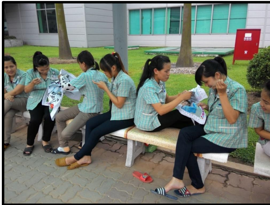
Lunch break at Samsung's Ban Ninh plant. Almost all the female workers are in their twenties.

Since January 1, 2007, after Vietnam became a full member of the World Trade Organization (WTO), government support and preferential treatment given to the electronics industry were also removed as a condition of Vietnam's accession to the WTO. Some FDI companies went bankrupt, stopped production or moved to commerce and services. However, since Vietnam's accession to the WTO, a new foreign investment wave has flowed into Vietnam, including major electronics industry investments from big companies such as Samsung Electronics (South Korea), Intel (USA), Nidec (Japan), Foxconn (Taiwan), Meikom (Japan), and Nokia (Finland). The investment projects by these groups increased the FDI capital in the Vietnamese electronics industry to over $10 billion USD.