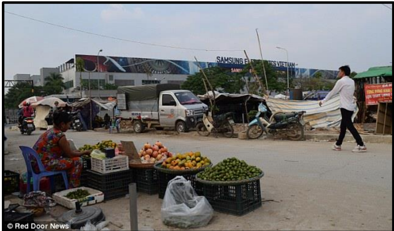
View of the Samsung plant in Bac Ninh province.

With available resources, the data collection of this study used mainly online data collection tools and in-depth interviews were only conducted with a small sample of women workers at the two study sites. As a result, the study sample is not nationally representative. In addition, data on chemical use in the factories, including specific substances was not available. The results of this study reflect the views of a sampling of women workers in two key electronics industrial zones. Online data collection may neglect research studies and statistics on this industry that the online tools cannot access. However, the study data shows an obvious trend of the actual lives of women workers in the electronics industry as well as general information on the current electronics industry in Vietnam.