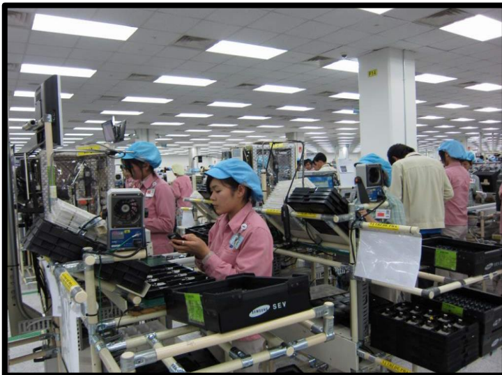
Mobile phone assembly at Samsung Vietnam.

The women interviewed in this study primarily worked in two types of mobile phone jobs: 1) Production line where each woman is responsible for one part of the assembly process –